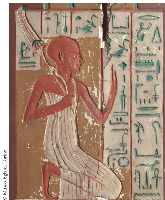
FIG. 8. Depiction of a hw -fan held by the vizier Neferrenepet on a door frame from Deir el-Medina (Cat. 1464, Museo Egizio, Torino).

It is particularly noteworthy that, among the titles under examination, the designation “Fanbearer on the right of the king” is the only one attested in Ramesside sources from Deir el-Medina. 28 In this context, however, it was applied exclusively to high-ranking officials who, while not members of the local community, maintained a close relationship with it. These individuals did not reside in Deir el-Medina, thereby suggesting that they were not the owners of the hw -fan specimens found at the site. This assertion is further corroborated by the craftsmanship, the type of raw material used, 29 and the decoration of the artefacts, which do not seem to match the quality that would have been expected for such a significant object. Indeed, the only recorded price for a hw -fan in Deir el-Medina textual sources is a modest 2 oipe (O. Cairo 25242). 30 Furthermore, the iconographic motif chosen for the mounting element of the Deir el-Medina specimens differs from the standard decoration employed in the depictions of the high officials (Fig. 8).